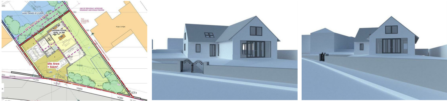
Building Plot, Mar Lodge Hay Place, Elgin, IV30 1LZ Offers over £110,000

A rare opportunity has arisen to purchase a building plot with full planning permission extending to approximately 566m2 situated in the sought after West end of Elgin. Planning permission is in place for a one and a half storey, 4 bedroom dwelling house.