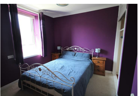
33 Victoria Crescent, Elgin, IV30 1RQ £110,000

End-terraced bungalow situated within walking distance to Elgin Town Centre. The accommodation comprises entrance vestibule, hallway, lounge, kitchen, rear porch/utility, double bedroom and bathroom. The property, which would make an ideal first time buy or retirement property, further benefits from double glazing, gas central heating, front & spacious rear garden and off-street parking.